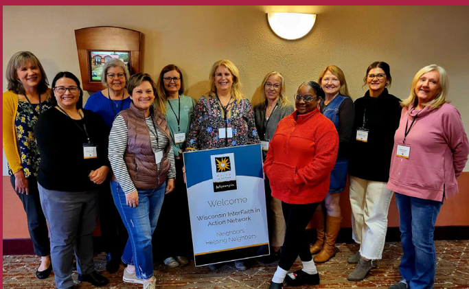
Annual WIFIAN conference, October 2025

There are many programs around the nation like Eastside Senior Services? You can learn more by checking any state's Area Agency on Aging!