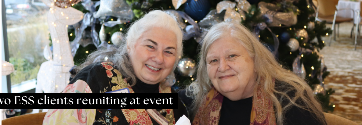
Two ESS clients reuniting at event